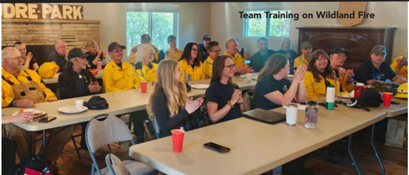
Team Training on Wildland Fire

Find out more about the fire district by attending one of the board meetings. They are on the second Wednesdays of the every month at 7 pm. Even months in the upper canyon, odd months in the lower canyon.